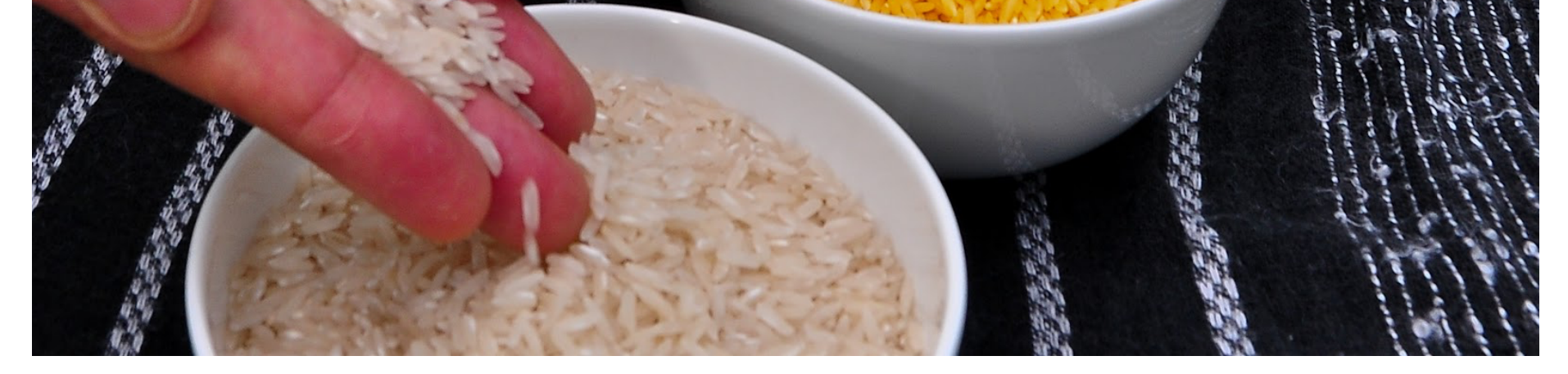
World is missing out on biotechnology's lifesaving benefits, plant scientists warn