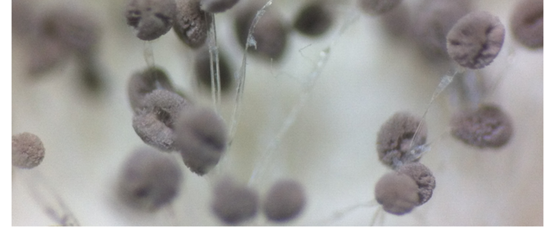
Transgenic fungus shows huge promise for malaria control in West Africa